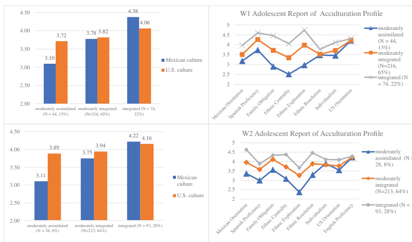
FIGURE 1 Three-class LPA solution of adolescent acculturation status at Wave 1 and Wave 2. On the left panel, adolescents' acculturation status at each wave is presented by an average of eight indicators